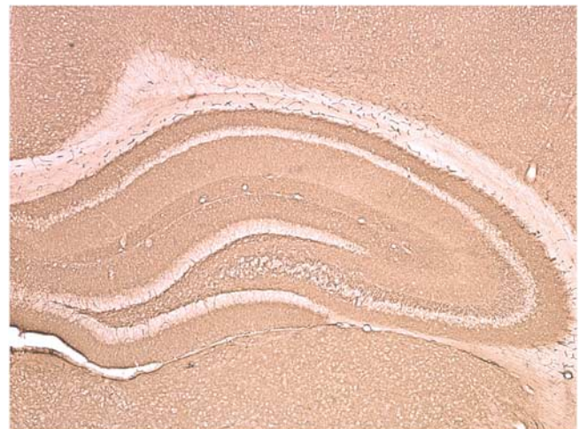
Figure 1 Photomicrograph of the hippocampus stained with synaptophysin (1:1000) and visualized with DAB. This image was taken at \times 5 magnification. Data measurements are based on a box of approximately 2000 pixels.

Early maternal separation produced significant changes in expression of synaptophysin in the hippocampus and amygdala, but not the prefrontal cortex. Early maternal separation effects on synaptophysin OD in the hippocam-